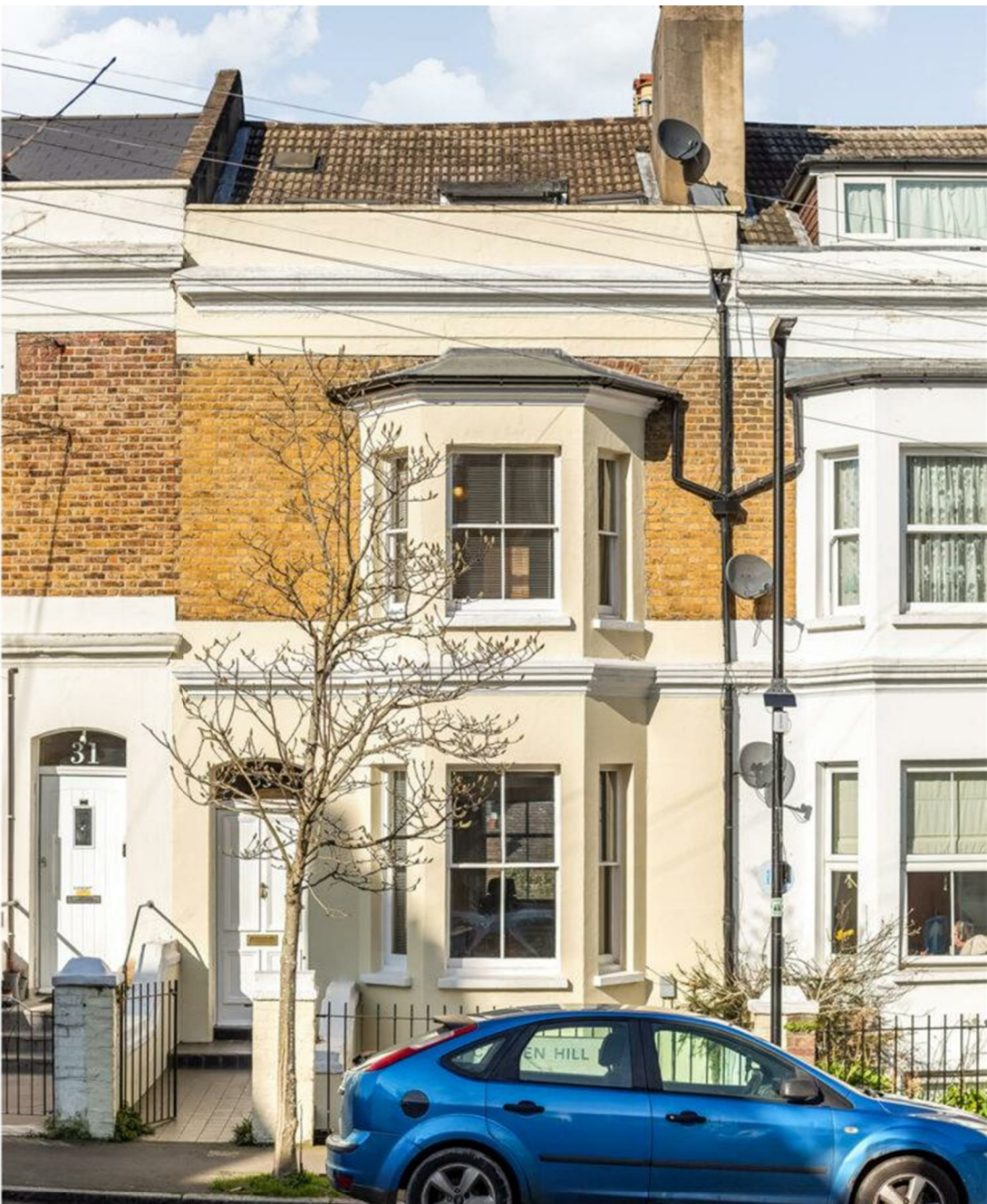
Camden Hill Road, SE19 | £1,300,000

02087029333 crystalpalace@pedderproperty.com